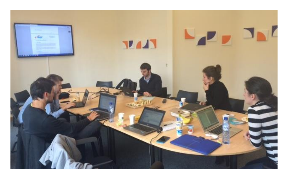
Board meeting in Brussels October 2015

In 2015, four Board meetings took place, one during the Annual Conference to reduce costs.